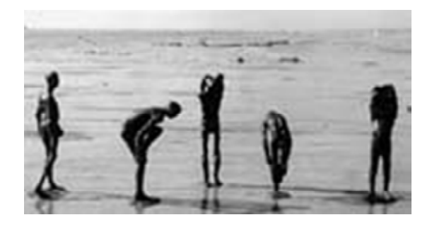
5 Figures on the Beach 1990 Bronze, 4"-7" High

This late work, the Beach Series II and the Dunescapes, span the extremes of scale: enormous plaster figures and miniature terracotta scenes. The large figures bring out what was always latent in the earlier figures, the darker, murkier, scarier aspects, but exaggerated by the size. The monumental figures of Beach Series II are the terrifying and unpredictable superhuman creatures who not only inhabit the child's early life (and the mythologies of the world) but remain to haunt us in our adult existence, even if only in our unconscious. The bronze disrobing man at first seems headless, or perhaps trussed up by a torturer, until we realize that he is just someone taking off his shirt. Or is he?